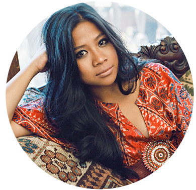
ZEE AVI Singer & Songwriter